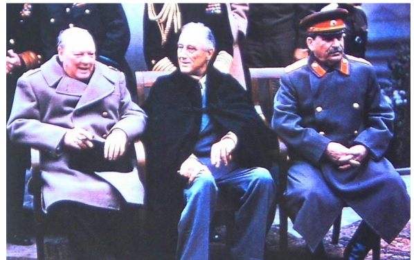
Chruchill Roosevelt Stalin