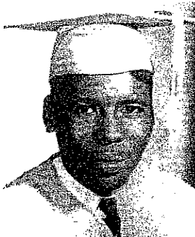
JIMMIE LEE JACKSON 1938-1965 Civil rights marcher killed by state trooper Marion, Ala.

"Jimmie Lee Jackson's death says to us that we must work passionately and unrelentingly to make the American dream a reality. His death must prove that unmerited suffering does not go unredeemed."