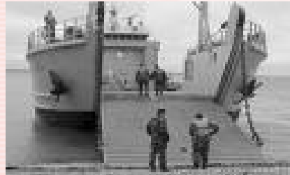
80,000 Landing Craft