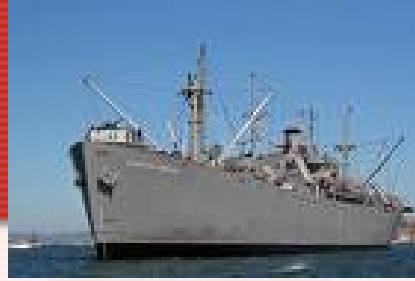
2,600 Liberty Ships